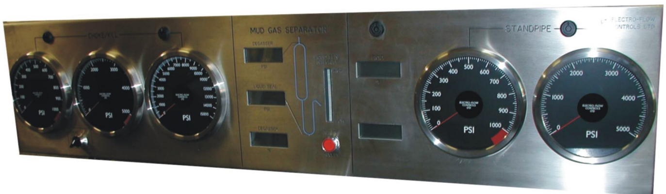
Finescale Pressure Gauges with Liquid Seal Monitor & Temperature displays