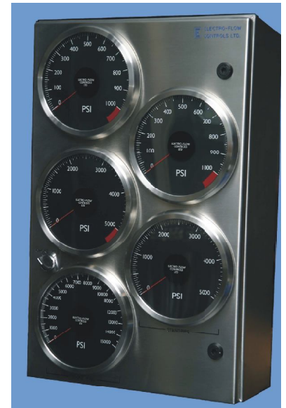
Vertical FSG 35

Unlike hydraulic systems, no manual isolation is required as gauge limits are reached. EFC's electronic solution ensures no damage to gauges or sensors.