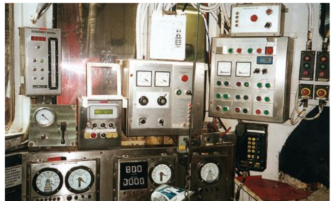
A Cluttered Cabin