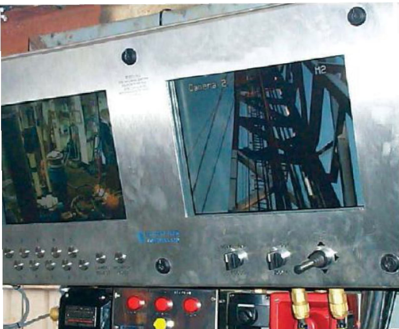
Typical Hazardous Area Dual TFT Screen