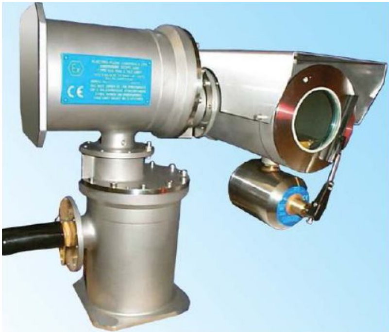
EFC Camera Assembly