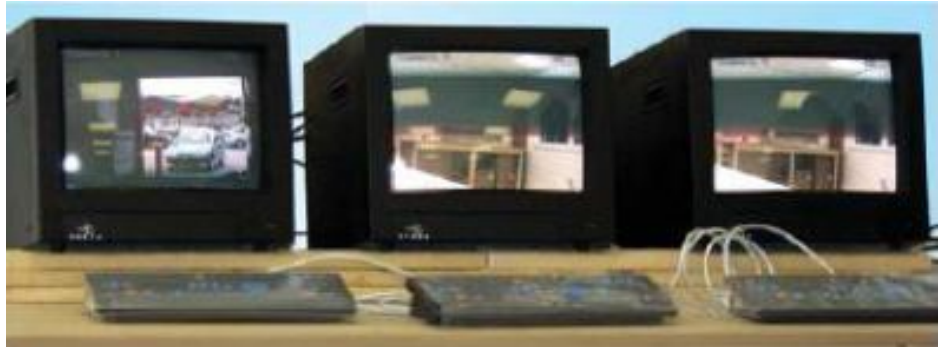
CRT Safe Area Monitors and Controls

Hazardous area internet TV Systems provide an IP address, allowing video from remote rig sites to be accessed and viewed by headquarters and onshore offices.