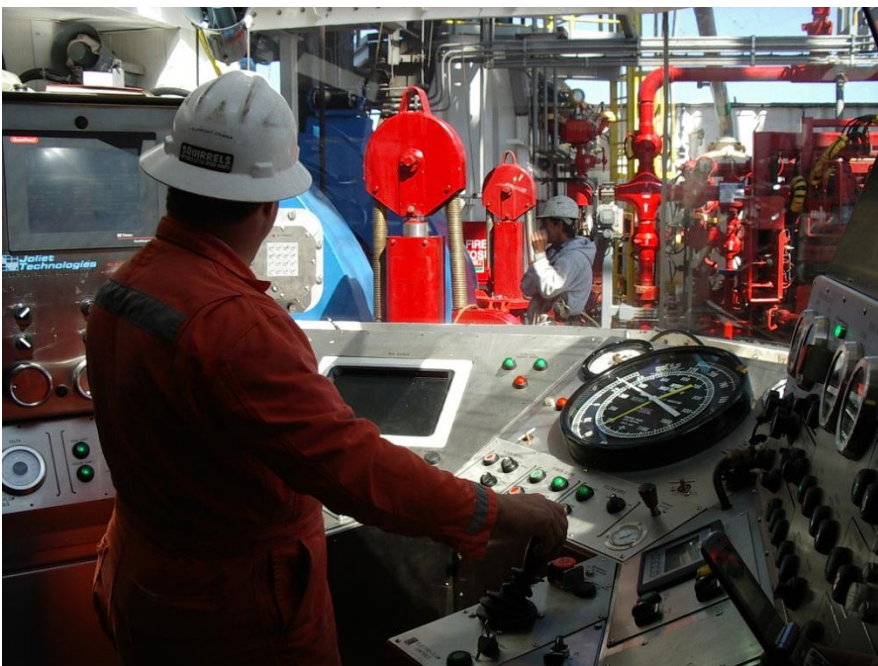
Complete drilling instrumentation and controls package